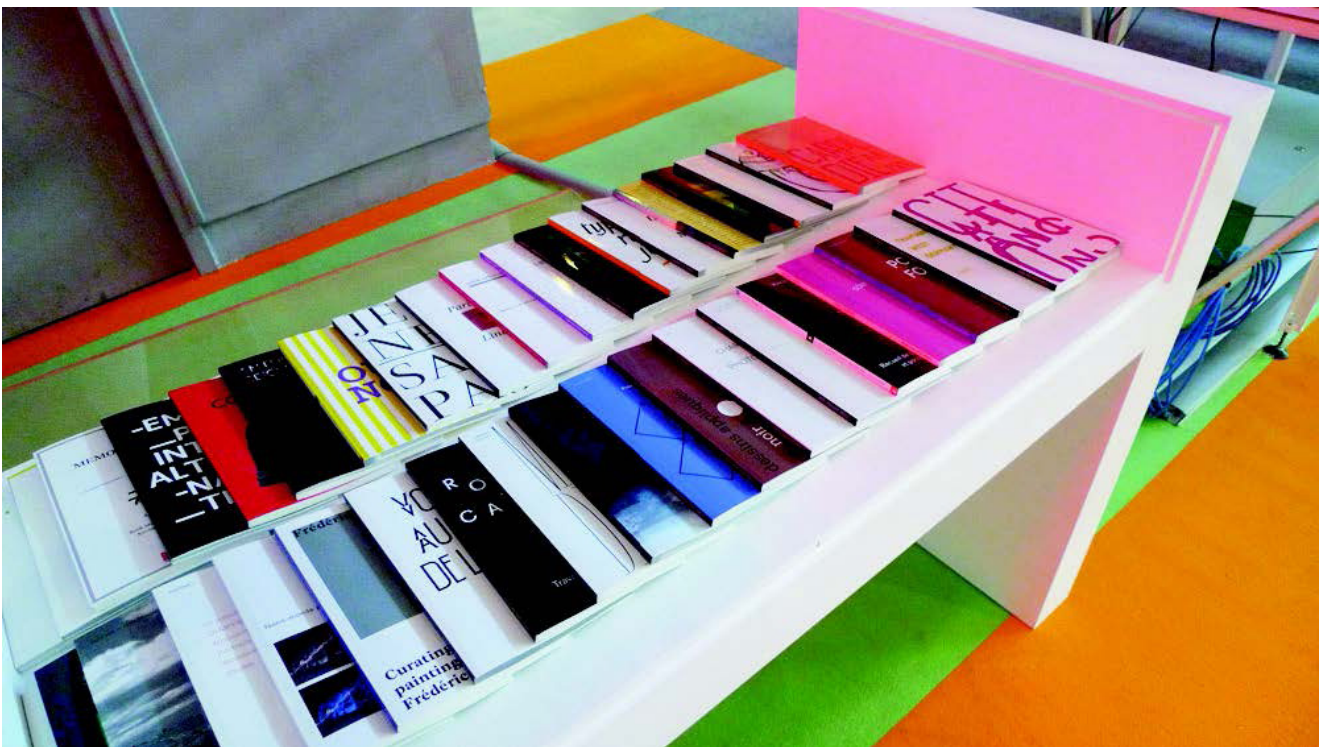
BOOK MACHINE PRESS @ BOOK MACHINE (Paris), Centre Pompidou, 2013

Before getting started, please carefully review the following guidelines – organisation of time and workflow with your designer is key to the success of your participation.