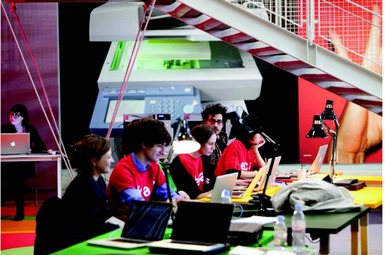
BOOK MACHINE PRESS @ BOOK MACHINE (Paris), Centre Pompidou, 2013